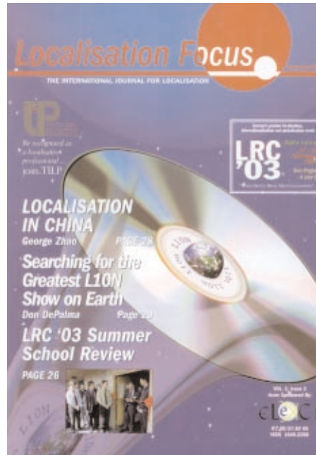
September 2003 issue of Localisation Focus , sponsored by ELECT

The final issue of 2003, December , contained results of the ELECT Awards and articles from the winners. Information on ELECT Online also appeared in an advertisement.