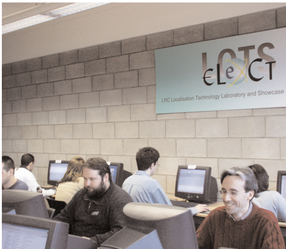
The LOTS Laboratory

Die Einrichtung LOTS (Localisation Technology Laboratory and Showcase), die an der irischen Universität Limerick untergebracht ist, vereinigt eine umfassende Auswahl der wichtigsten Lokalisierungstools. Damit erhalten Wirtschaft und Forschung die Möglichkeit, die neuesten Tools auf allen gängigen Betriebssystemen zu testen und zu bewerten. Darüber hinaus lassen sich die Tools auch hinsichtlich Leistung und Einhaltung von Standards prüfen. Inzwischen wurde auch der LOTS Online-Server eingerichtet, mit dem auf die meisten Tools nun auch über das Internet zugegriffen werden kann. Die LOTS-Nutzung zu Bildungs- und