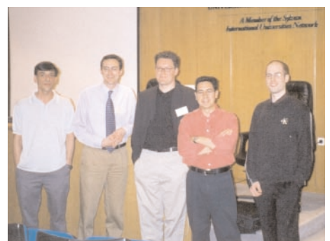
LOTS discussion group at Universidad Europea de Madrid.

Once the user has logged on to one of the LOTS servers or any of the PCs available in the LOTS Laboratory, an introductory online tutorial is available on the