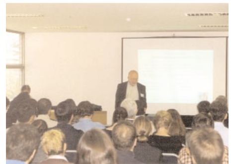
Professor David Parnas addresses the attendees at the 2003 conference