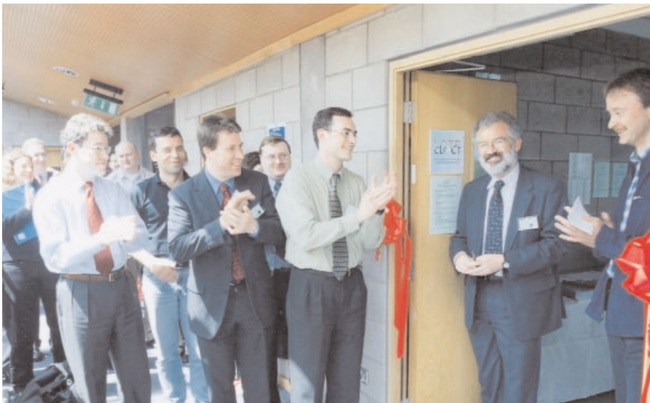
Opening of LOTS Laboratory, June 2003

Also, a number of exhibition and discussion days were held in 2003. The aim was to provide a discussion forum where experts in localisation could exchange ideas, problems, and suggestions related to localisation.